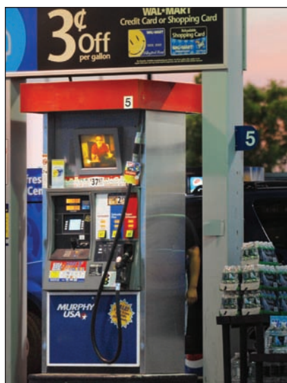
MIXED MESSAGE: Promotional material highlighting the 3-cent-per-gallon discount Wal-Mart card users enjoy at Murphy, as well as cigarette price specials and a Gas Station TV monitor, maximize the marketing potential of the fuel-transaction experience at Murphy USA sites.

In fact, it's the potential of capturing as little as an addi-